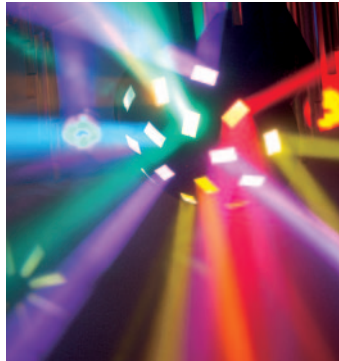
Tough, reliable and safe: The new lamps are even more durable and can be used for so many different applications, for example in projection units, photographic and effect light.