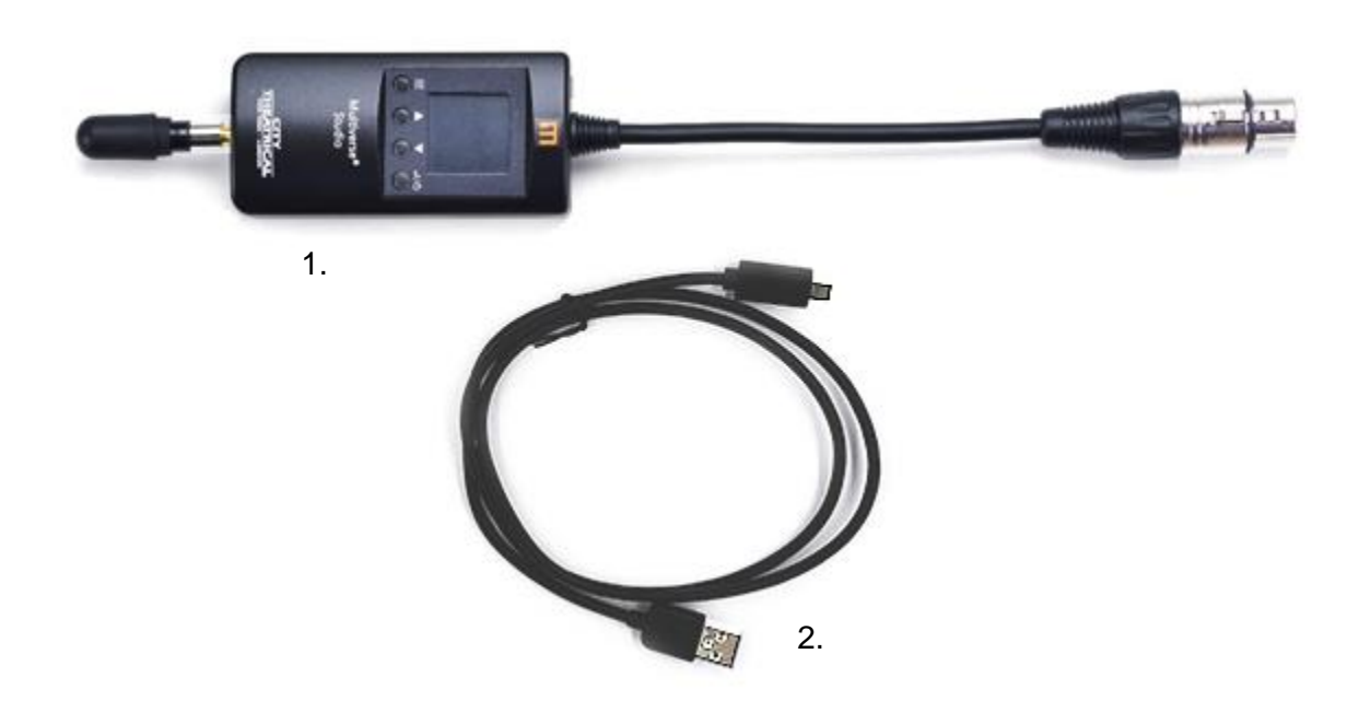
Figure 1: What's Included