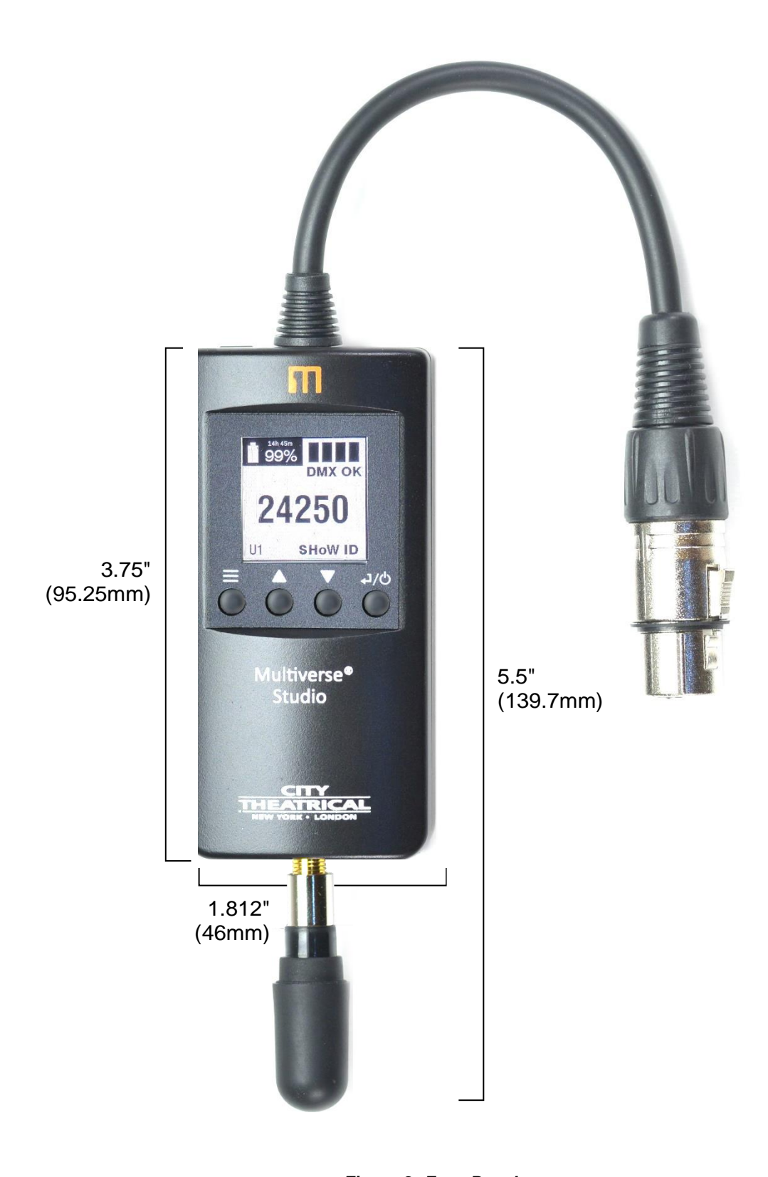
Figure 2: Face Panel