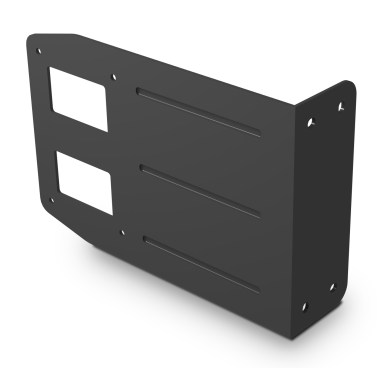
MASKCL-BL L-shaped side bracket for MASK4C(T)-BL / MASK6C(T)-BL