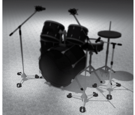
TriPads isolate drum mics from vibrations created by the drums themselves.