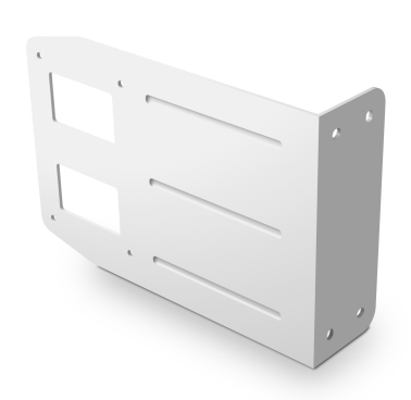
\label{eq:MASKCL-W} \mbox{$L$-shaped side bracket for MASK4C(T)-W / MASK6C(T)-W}