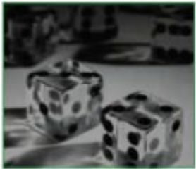
2000:1 Contrast Ratio

Add more depth to your image with a high contrast projector; with brighter whites and ultra-rich blacks, images come alive and text appears crisp and clear - ideal for business and education applications.