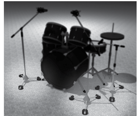
TriPads isolate drum mics from vibrations created by the drums themselves.