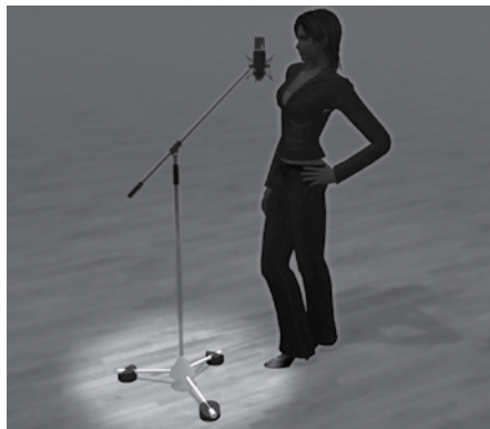
TriPads isolate a voice-over mic placed on hardwood floors.