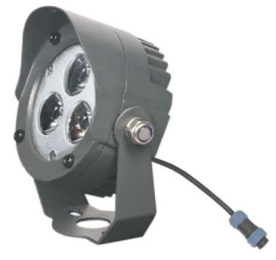
4-pin male IP68