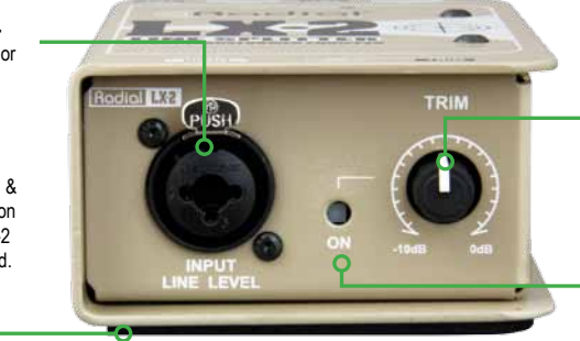
TRIM LEVEL - Attenuates the signal at the input of the I X-2

NO SLIP PAD -Provides electrical & mechanical isolation and keeps the LX-2 from sliding around.