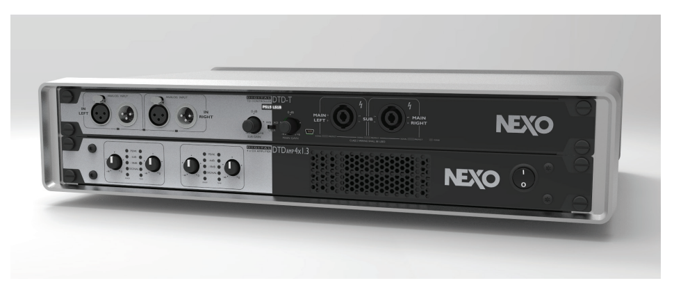
DTD Controller + DTDAMP: input/output patch bay, processing and 5 kW of power in a 2U light rack.

When used with the Nexo DTD controller the DTD<sub>AMP</sub> is the perfect solution for "Dry" hire or where the user has a limited knowledge but still allowing the best possible result from the Nexo speaker system.