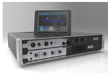
DTD and companion amplifier DTDAMP with Dory remote control software running on an Android tablet.

The mini-USB port allows the user to update the unit firmware from the Dory software, to add new functions or to download new NEXO speaker presets.